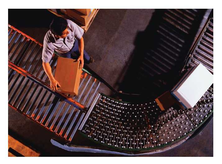
Performance Verification Ensures Your Peak Performance

Quincy Compressor proudly publishes total package ACFM which is measured and reported in accordance with industry standard CAGI/PNEUROP PN2CPTC2 guidelines. Every Quincy QGS meets or exceeds CAGI/PNUEROP PN2CPTC2 guidelines - ensuring that you get every acfm that has been promised.