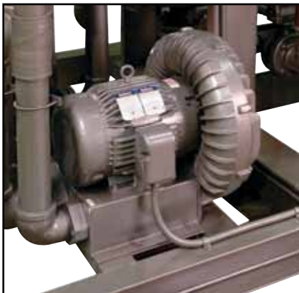
Centrifugal, multi-stage blower