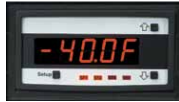
Dew Point display